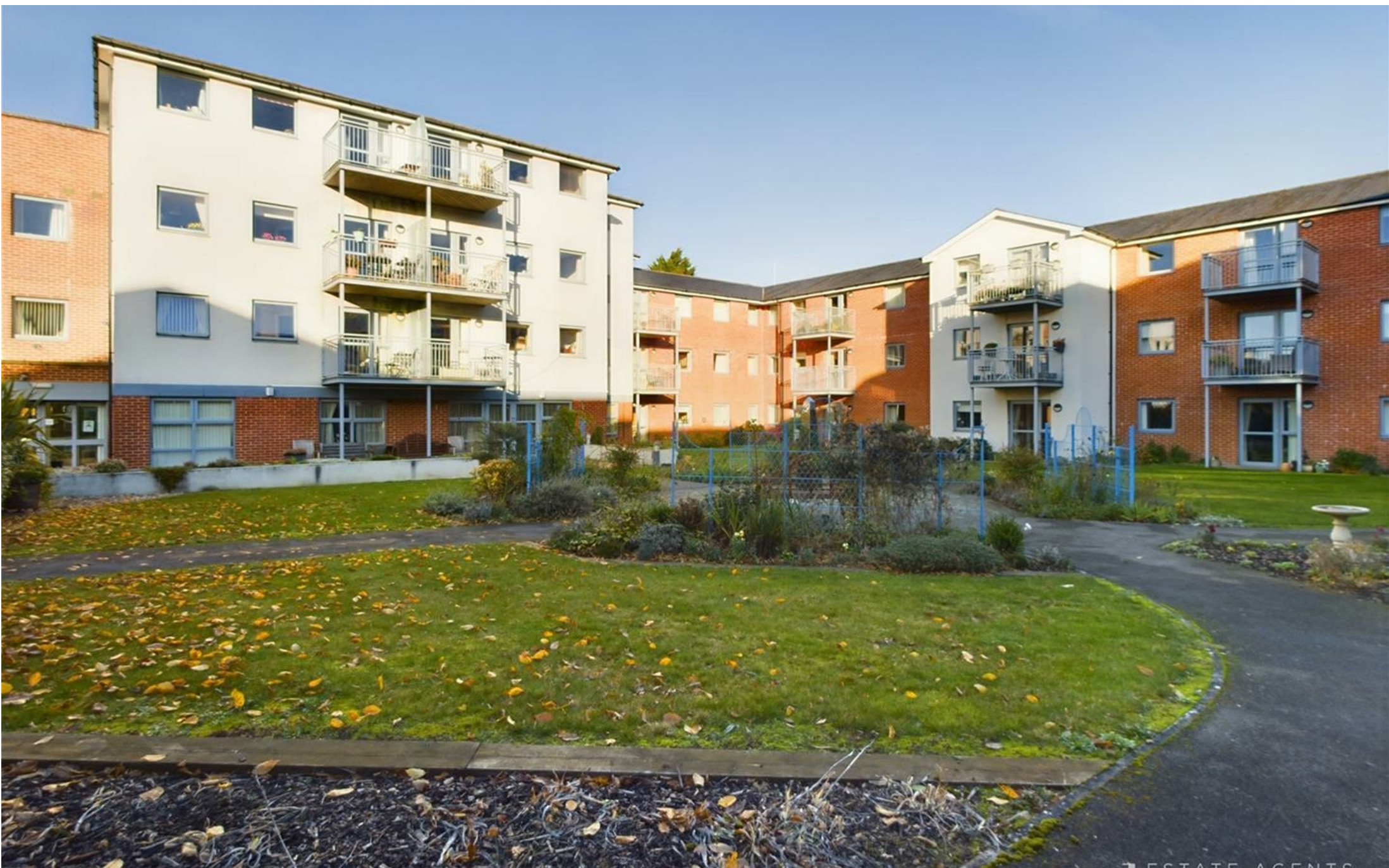
Lady Susan Court, New Road, Basingstoke, RG21 7PF